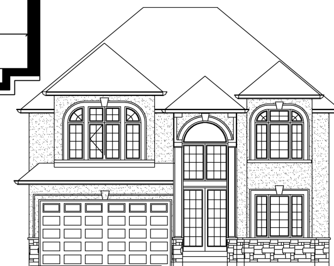
OPTIONAL ELEVATION B

Interior layout changes can be done at no extra charges.